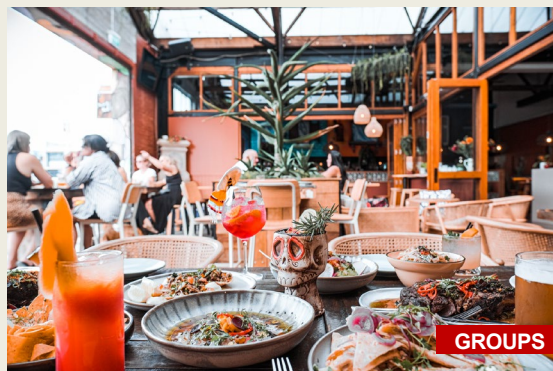
MUY MUY 44 Welles Street Christchurch

Open Tuesday – Sunday, available for private hire seven days for up to 70pax inside and 110pax in warmer months