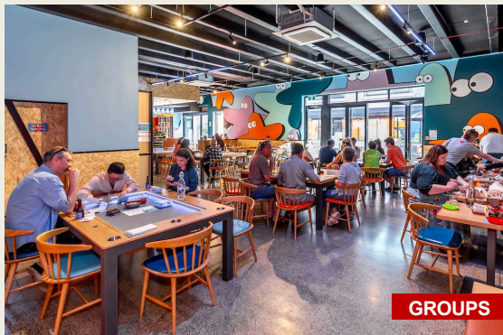
MEEPOPOLIS 5/150 Lichfield Street Christchurch

Meepopolis is a board game cafe & bar in Christchurch with a space designed specifically for games; a delicious selection of catering options; hundreds of games to hire and play in-store; and a friendly team of Game Guides ready to help people of all experience levels find the right game for them. Meepopolis is the perfect location for a casual and fun get together.