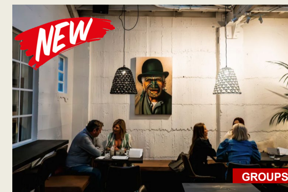
KOKOMO 20-26 Welles Street Christchurch

Function@littlehigh.co.nz More information Open 7 days Group bookings up to 80pax