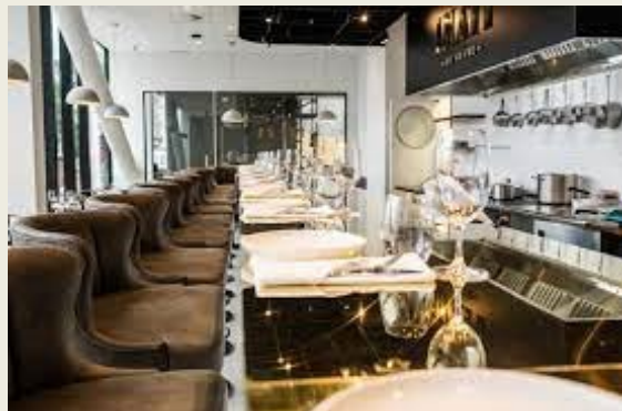
INATI 48 Hereford Street Christchurch

Inati is one of Christchurch's top restaurants. Utilising the finest produce sourced locally, we will showcase the best of Canterbury and New Zealand in an elegant, approachable and most importantly, respectful manner. The 6 or 8 course trust the chef is a must try.