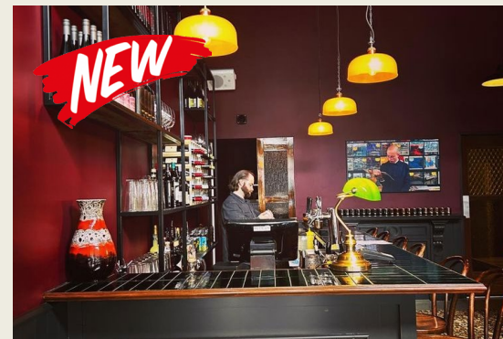
LITTLE MONDAY 161 High Street Christchurch Central City

More information cellardoor@tussockhill.com Available for groups