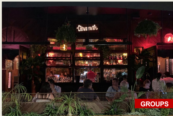
CHIAHWAH The Terrace, Oxford Terrace Christchurch

Chiwahwah is located along the vibrant Terrace hospitality precinct. Bringing together stylish modern interiors, crafted food and amazing cocktails.