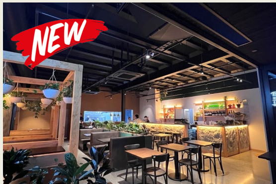
BREWDA 93 Cashel Street Christchurch Central City

Welcome to Brewda, where the soul of Korea meets the heart of fusion. We are not just a bar; we are an experience, a harmonious blend of tradition and innovation. At the core of our identity is a passion for Korean cuisine, reimagined with a modern twist.