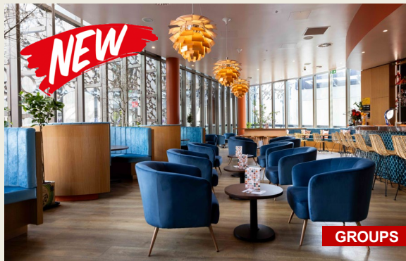
BAR FRANCO 166 Cashel Street, The Crossing Christchurch

A Welcoming atmosphere infused with Mediterranean hospitality. Level 1 is a Spritz and Negroni Bar, and Level 2 is a dining room with open Kitchen.