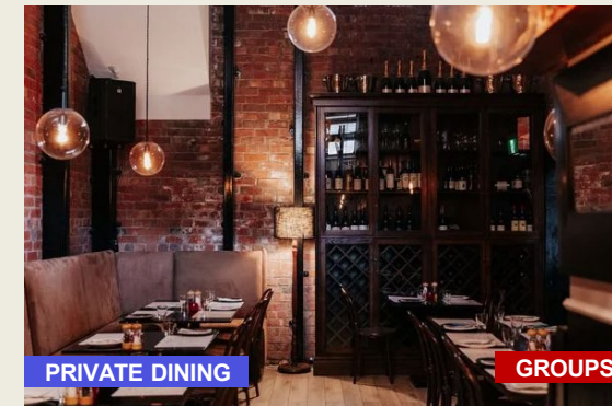
THE MONDAY ROOM 161 High Street Christchurch

Our ever-popular banquet style shared dining, combined with our extensive wine list and ever-changing cocktail menu; never fails to provide a phenomenal dining experience. We use the freshest local produce and ingredients and offer our ever popular 'Trust the Chef' set menu every night to any and all tables of 2 or more.