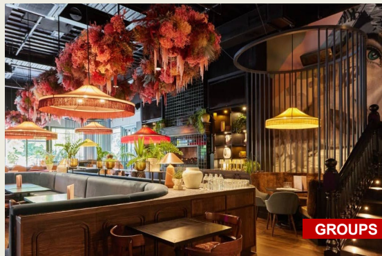
DELILAH The Terrace, Oxford Terrace Christchurch

Dress up, turn up, wind down. Delilah's lush vibe is the perfect mix of frills and chills. The Terrace welcomes a new neighbour. The mysterious, the delightful, Delilah. Open for lunch and dinner. Outdoor seating available.