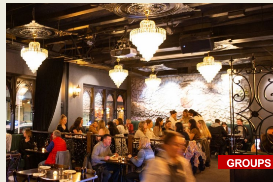
ORIGINAL SIN The Terrace, Oxford Terrace Christchurch

Original Sin is a premium Italian inspired restaurant in the heart of Christchurch City. Guests are invited to indulge in a unique dining experience surrounded by decor designed to capture the Adam and Eve era. With dark woods, velvet and lush interiors this is the perfect venue for dinner bookings, large or small.