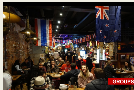
LITTLE HIGH 255 Saint Asaph Street Christchurch Central City

info@bloodymarys.co.nz More information Open 7 days Private dining up to 30 - 70pax