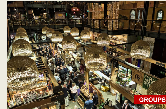
RIVERSIDE MARKET Corner Lichfield St & Oxford Terrace Christchurch

Group bookings and private hire available for 20pax