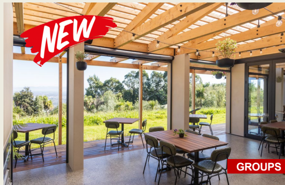
TUSOCK HILL VINEYARD RESTAURANT 210 Huntsbury Avenue Cashmere

Tussock Hill serves a delicious selection of seasonal sharing plates that highlight local Canterbury produce and our own organic wine. Our menu changes and develops with the season and what our local producers are able to provide. We are open Wednesday- Thursday 10am-4pm and Friday-Sunday 10am-5pm