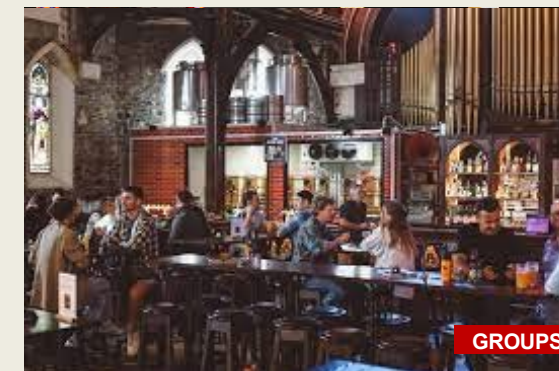
THE CHURCH 124 Worcester Street Christchurch

A unique pub space, yet so fitting for the city, The Church is well worth stepping into just to appreciate the stunning architecture and playful reuse of a building that was left in ruins after the earthquakes. Everything within the space plays homage to the building's previous existence. The cornerstone of Christchurch Hospitality. With live music at the forefront, wood-fired pizzas, a large open bar area, lush mezzanine floor and a beautiful sun-soaked courtyard,