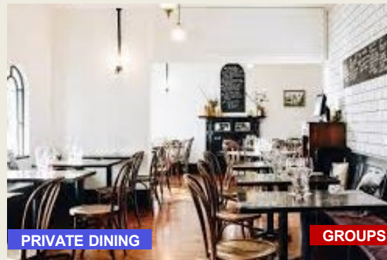
TWENTY SEVEN STEPS New Regent Street Christchurch

Located on beautiful New Regent Street, 27 Steps is located upstairs in a delightful setting. The menu focuses on exceptional produce cooked well. This is a great option for those keen on a relaxed evening.