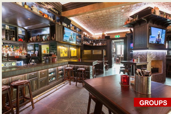
THE LITTLE FIDDLE 132 Oxford Terrace Christchurch

A venue to restore all faith in true Irish culture, live music, outstanding fare and designed to entertain to the fullest.