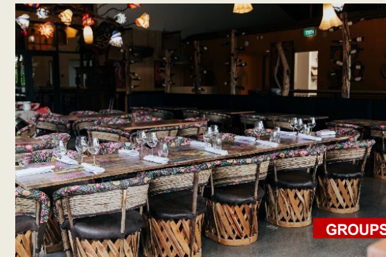
CASTROS Riverside Market, Level 1 Christchurch

Castro's is a Spanish tapas bar newly opened in the vibrant Riverside Market complex. Culinary options include seafood, chicken, pork or vegetarian paella, which you can have with a glass of Spanish wine, or any of Castro's range of cocktails.