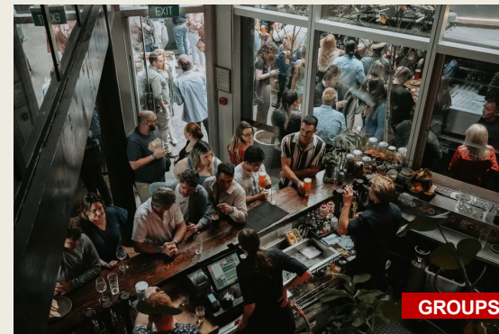
CASCADE BAR & COURTYARD Strangers Lane, 219 High Street Christchurch

Cascade Bar and Courtyard, a space designed for you to be social. As well the classics, we specialise in our own custom designed cocktails, created using premium ingredients and our team's extensive international cocktail experience, with seasonal menu changes to keep things interesting. The wine and craft beer list has some of the best wines our region has to offer, a great range from further afield, including premium champagne bottles and specially selected craft beer.